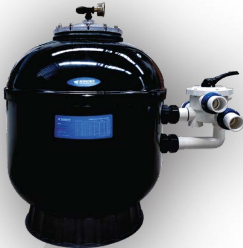
GS SERIES SIDE MOUNTED LEMINATED FILTER

www.minderwater.com.au sales@minderwater.com.au