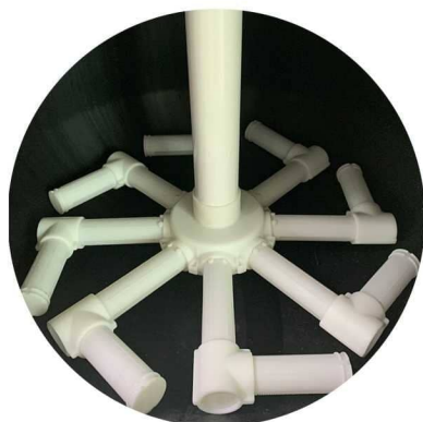
Designed for Windmill Lateral