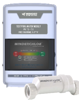
MINDER Chlor Chlorine Generator