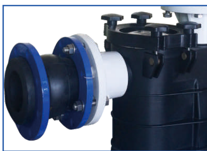
Flange connection & transparent lid