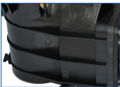
Robust plastic body