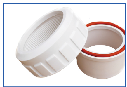
Easy union connection union 3" / 90mm 20651