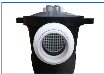
Robust plastic body for high power pump